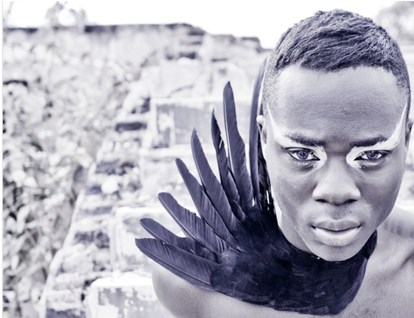
Noctua | A Seven Everything Collaboration