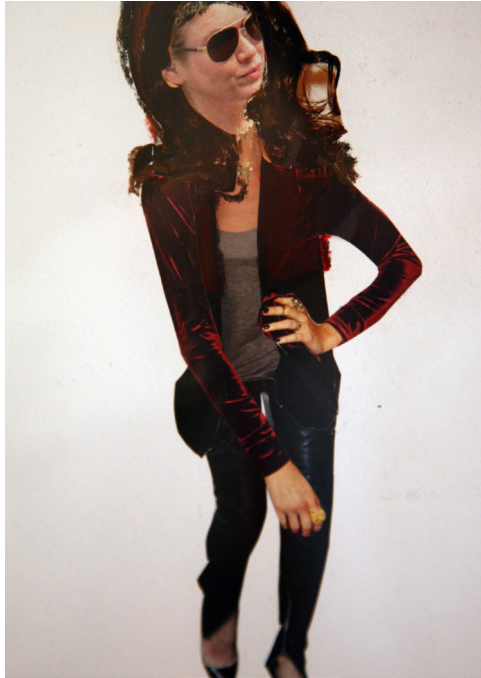
Disfiguration - Refiguration